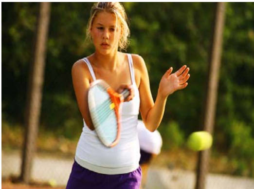
Tennis is one of our most popular activities at camp. The camp community offers opportunities to learn new things, explore personal interests and have fun!

HEALTH INSURANCE: Cape Cod Sea Camps, Inc. does not provide coverage for any non-work related injuries. Individuals must carry their own insurance for medical coverage. Proof of a health insurance policy for medical coverage is required. A Section 125 plan is available.