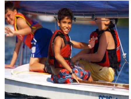
Many different water and land sports are taught by counselors who are certified.

Resident Camp - The general commitment for staff will be from approximately June 20th to August 18th. Call for specific dates. The camp season is 7 weeks long for our campers. Counselors are expected to commit to eight-weeks including staff orientation, the 7 week summer program and remaining at camp until all their responsibilities are completed after the campers depart.