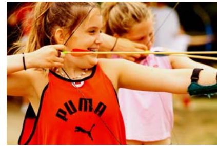
Staff teach all skill levels with awards systems in place for most activities.

DAY CAMP CREW UNIT: The 4-6 year old group is a special part of our day camp program. This is a self-contained unit operating much like a nursery or