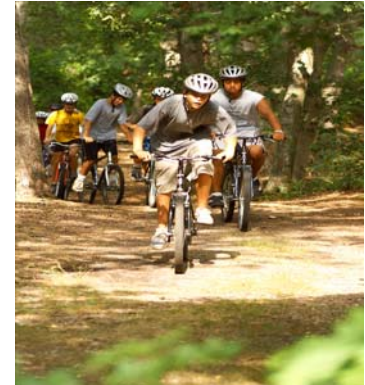
Staff are encouraged to introduce new activity offerings complimenting our camp philosophy.

OVERNIGHT COVERAGE: Days A-Way staff have rotating overnight assignments. On a rotating basis all staff members will be eligible to assist in coverage of any special overnights. A schedule of assigned shifts is posted during orientation week. JC Staff are assigned to supervise and cover each JC overnight.