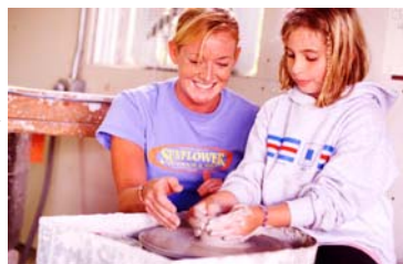
Staff are assigned to teach activities on a weekly basis based on your qualifications and interests.

The major activities we hire staff to teach are the following: Sailing, Swimming, Tennis, Arts and Crafts, Arch-