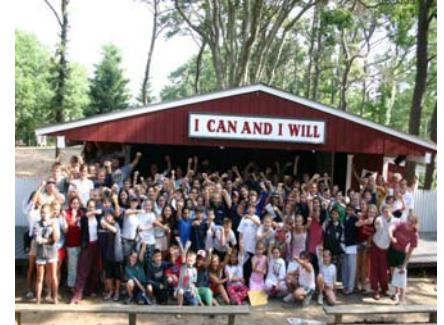
Our Resident Camp Motto is "I Can And I Will". Our Day Camp Motto is "Where

EMPLOYMENT BACKGROUND INFORMATION: Employees who may have unsupervised contact with campers must have a background free of adverse conduct, criminal or otherwise, which would disqualify a person from employment working with children. Screening of staff includes contacting references, reviewing