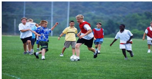
Team sports offered are soccer, lacrosse, basketball, field hockey, baseball, volleyball and many others. Each major activity (sailing, swimming, tennis, land sports, etc.) is supervised and organized by a department head.

Cape Cod Sea Camps, Inc. supports and maintains an environment that encourages any camper who believes he/she has been a victim of child abuse or neglect as defined in this policy to report the incident(s) immediately to her counselor, head counselor or director.