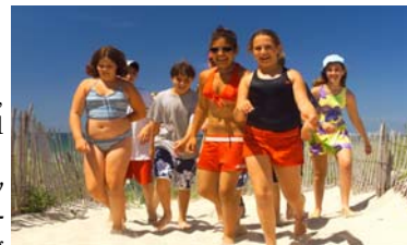
Resident campers range in age from 8-17 and Day campers are ages 4-17.

Day Campers - There are approximately 300 campers per week and eight units of 30-40 campers and 5-6 staff.