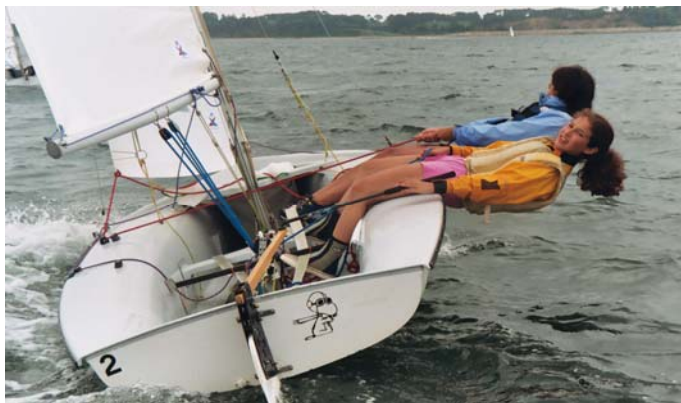
Challenging yourself to try new things as a camper and as a counselor is an important part of the camp experience. Attitude is everything!!

prior work history, performing a SORI (sexual offender registry information) and CORI (criminal offender registry information) check, and may include lawfully reviewing social networking sites and blogs.