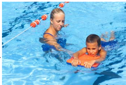
Swimming is taught in our fresh water pool. We also swim at our waterfronts on Cape Cod Bay and Long Pond, a fresh water lake.

PHYSICAL EXAMINATION: PHYSICAL EXAM FORMS ARE DUE JUNE 1 st . The Commonwealth of Massachusetts requires that all camp staff members, prior to arriving at camp, must have a completed health history, physical examination and current immunization record. The exam must be conducted during the preceding 24 months and include proof of immunization as well as a negative test for tuberculosis.