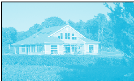
New Art Center Opened June 2006

Led by art educators, the art program is extremely popular with all age groups. Each day, campers are introduced to new mediums and allowed to either continue with old projects or begin new ones. With a full week of lessons, campers are able to accomplish varied and detailed projects.